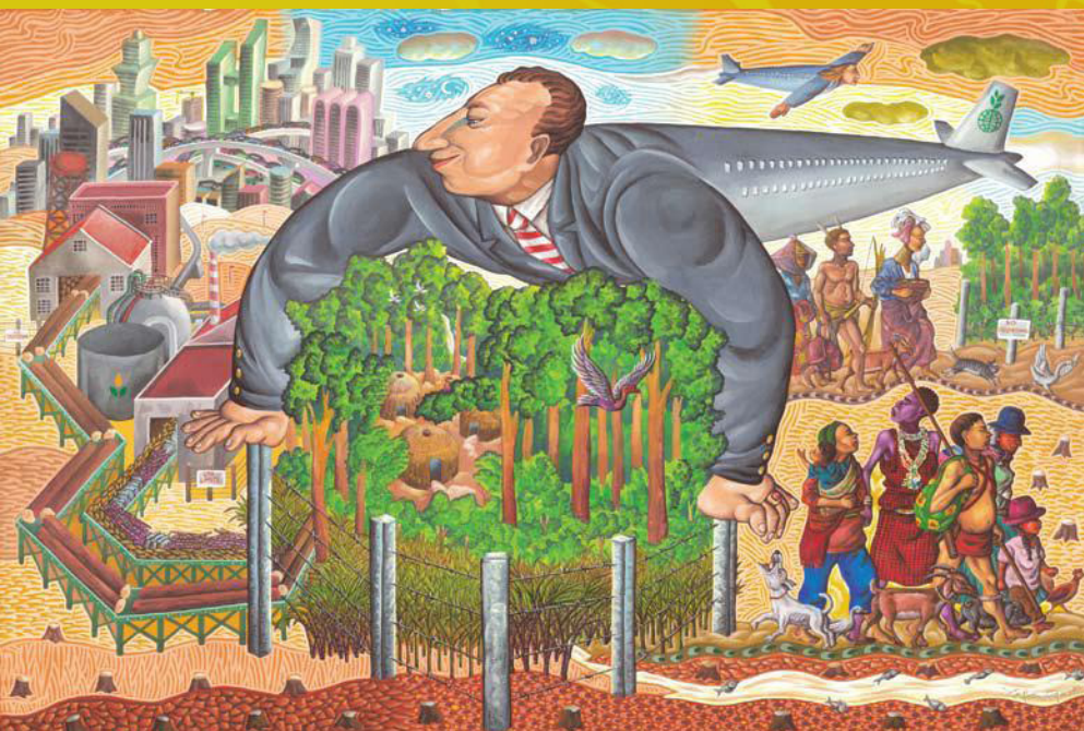
Illustration by Boy Dominguez, Journal of Peasant Studies issue on Green Grabbing (2012)