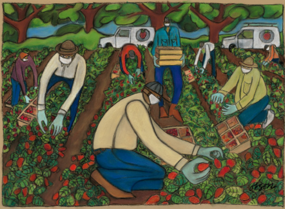
Farm Workers -Vegetable and Fruit Pickers – Essential Worker Portrait #6 by Carolyn Olson, http://carolynolson.net

The COVID-19 pandemic is far from abating: infections continue to spike in numerous countries with the emergence of new, more contagious strains of the SARS-COV-2 virus.