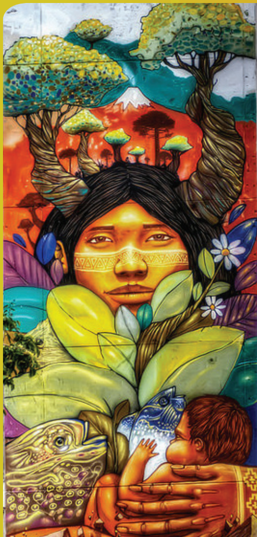
Alapinta crew in Paris